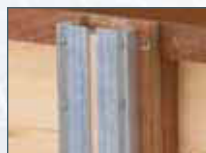
Plane Stop Prevents work in progress moving