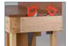
Saw Rack Left or Right Mounted