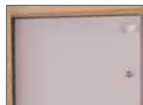
Cupboard 400 x 400 x 400 Left or Right Fitting