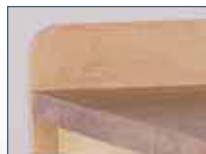
Back Lip 18mm Plywood