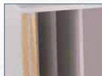
PC Tower Rack Left or Right Fitting