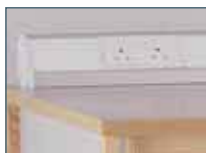
Service Panel Full Width Trunking