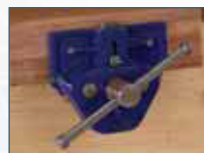
Record Vice 175mm Jaws (Factory fitted only)