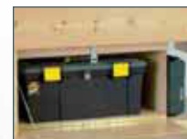
Security Cupboard Left or Right Positioning. Lockable