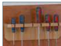
Tool Rack 6 Slot - Back Panel or Side Mounted